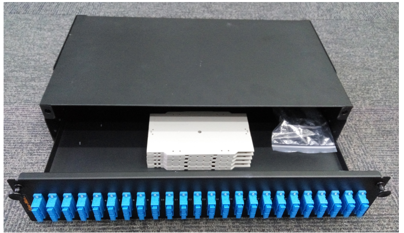
2U 24 SC Duplex F.O. Panel